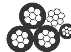
Cross sectional view of Aerial Bunch Cables

The phase conductors are being allowed to slide freely over the messenger conductor during temperature fluctuation. It is also to be ensured that during sliding the insulation should not get scratches due to rubbing effect. During expansion and contraction, the phase conductors try to move toward the ends exerting additional stress at the terminating point or at the clipping point. By special twisting process such forces are neutralised. During installation and branching off, phases conductors can easily be loosened to crimp to the connectors without straining and damaging the phase conductor.